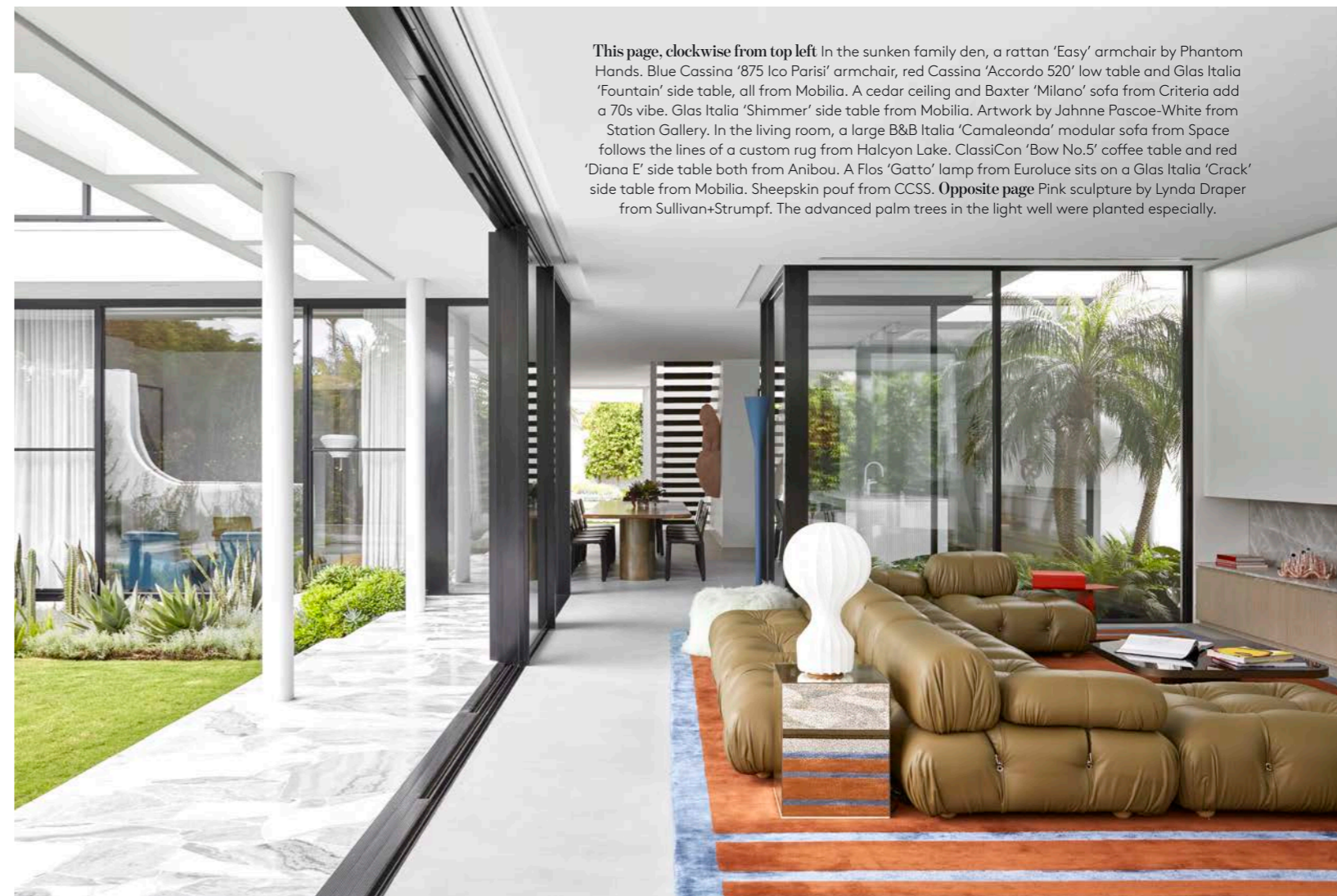
This page, clockwise from top left In the sunken family den, a rattan 'Easy' armchair by Phantom Hands. Blue Cassina '875 Ico Parisi' armchair, red Cassina 'Accordo 520' low table and Glas Italia 'Fountain' side table, all from Mobilia. A cedar ceiling and Baxter 'Milano' sofa from Criteria add a 70s vibe. Glas Italia 'Shimmer' side table from Mobilia. Artwork by Jahne Pascoe-White from Station Gallery. In the living room, a large B&B Italia 'Camaleonda' modular sofa from Space follows the lines of a custom rug from Halcyon Lake. ClassiCon 'Bow No.5' coffee table and red 'Diana E' side table both from Anibou. A Flos 'Gatto' lamp from Euroluce sits on a Glas Italia 'Crack' side table from Mobilia. Sheepskin pouf from CCSS. Opposite page Pink sculpture by Lynda Draper from Sullivan+Strumpf. The advanced palm trees in the light well were planted especially.