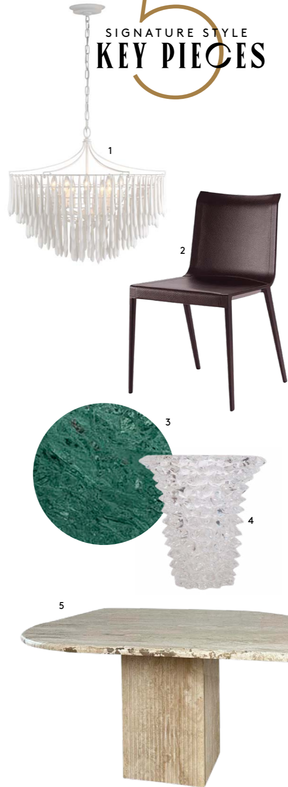
1 Julie Neill 'Vacarro' chandelier, $6890, from The Montauk Lighting Co. 2 B&B Italia 'Charlotte' chair in Bordeaux, $2720, from Space. 3 Verde Guatemala stone, POA, from Signorino. 4 Bespoke Italian Murano rostrato vase, from $1650, from eModerno. 5 Vintage solid-travertine dining table, $5393, from 1stDibs.