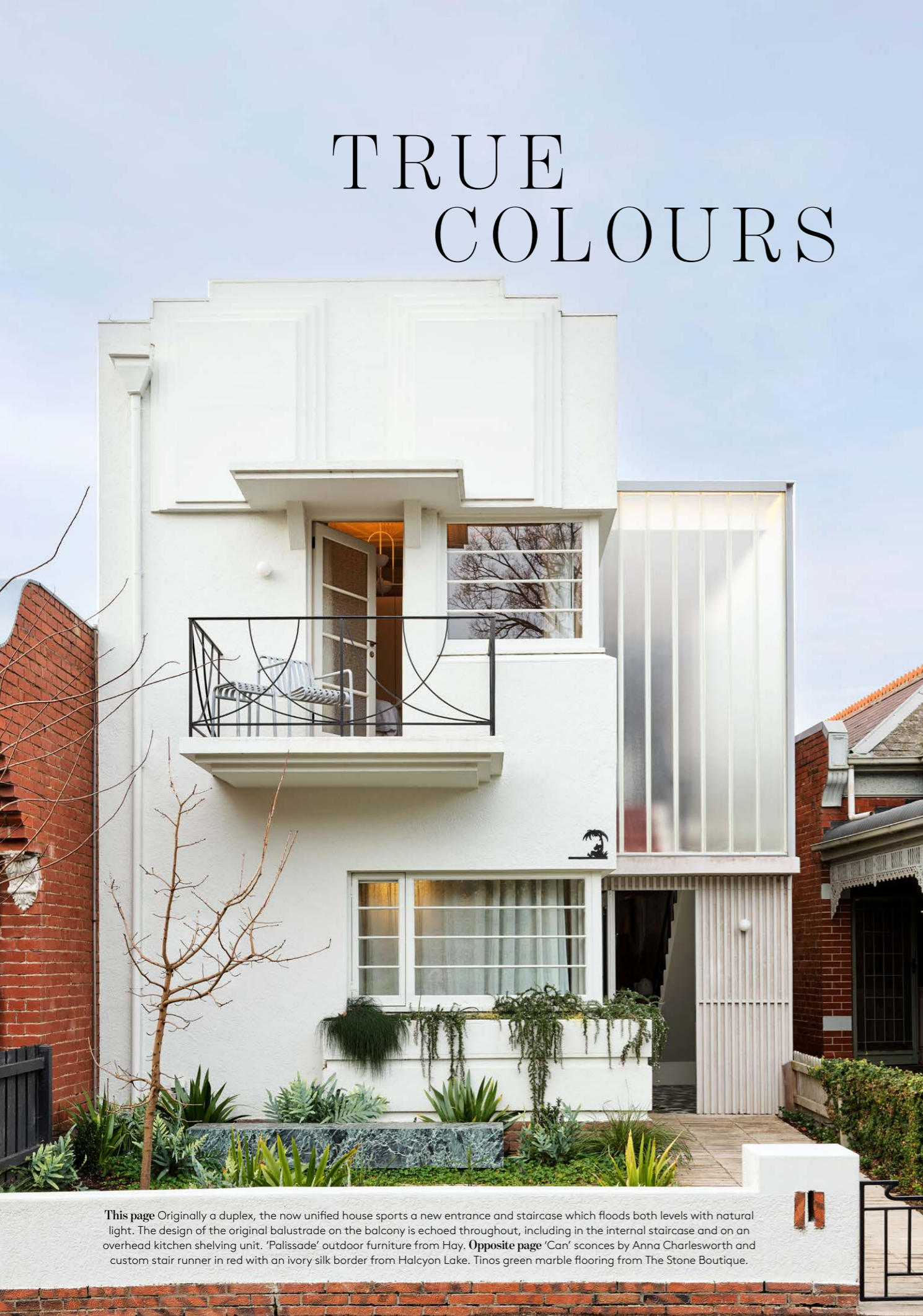
This page Originally a duplex, the now unified house sports a new entrance and staircase which floods both levels with natural light. The design of the original balustrade on the balcony is echoed throughout, including in the internal staircase and on an overhead kitchen shelving unit. 'Palissade' outdoor furniture from Hay. Opposite page 'Can' sconces by Anna Charlesworth and custom stair runner in red with an ivory silk border from Halcyon Lake. Tinos green marble flooring from The Stone Boutique.

The white exterior of this inner-city art-deco gem belies the luxurious jewel box of colour and textures of the interiors by Flack Studio.